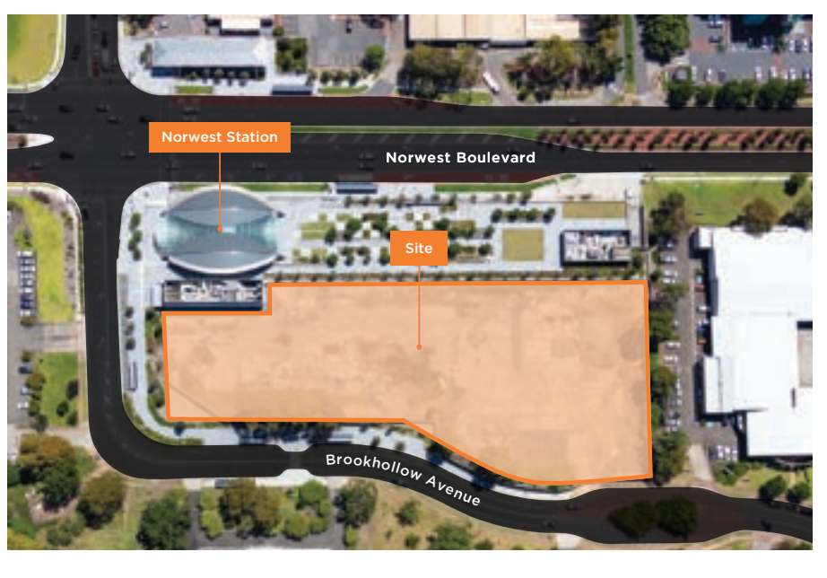
Site boundary is indicative only